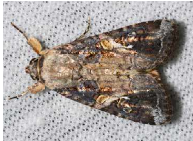
Fall Armyworm moth.

This method is efficient, selective and harmless for fauna, flora, operators and local residents. It does not generate residues, inputs or resistance mechanisms.