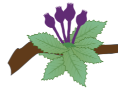
Early Fruit Development