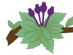
Minor Summer Flush