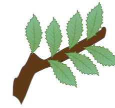
Minor Autumn Leaf Flush