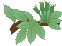
Spring Leaf Flush