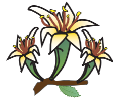
Flowering & Fruit Set